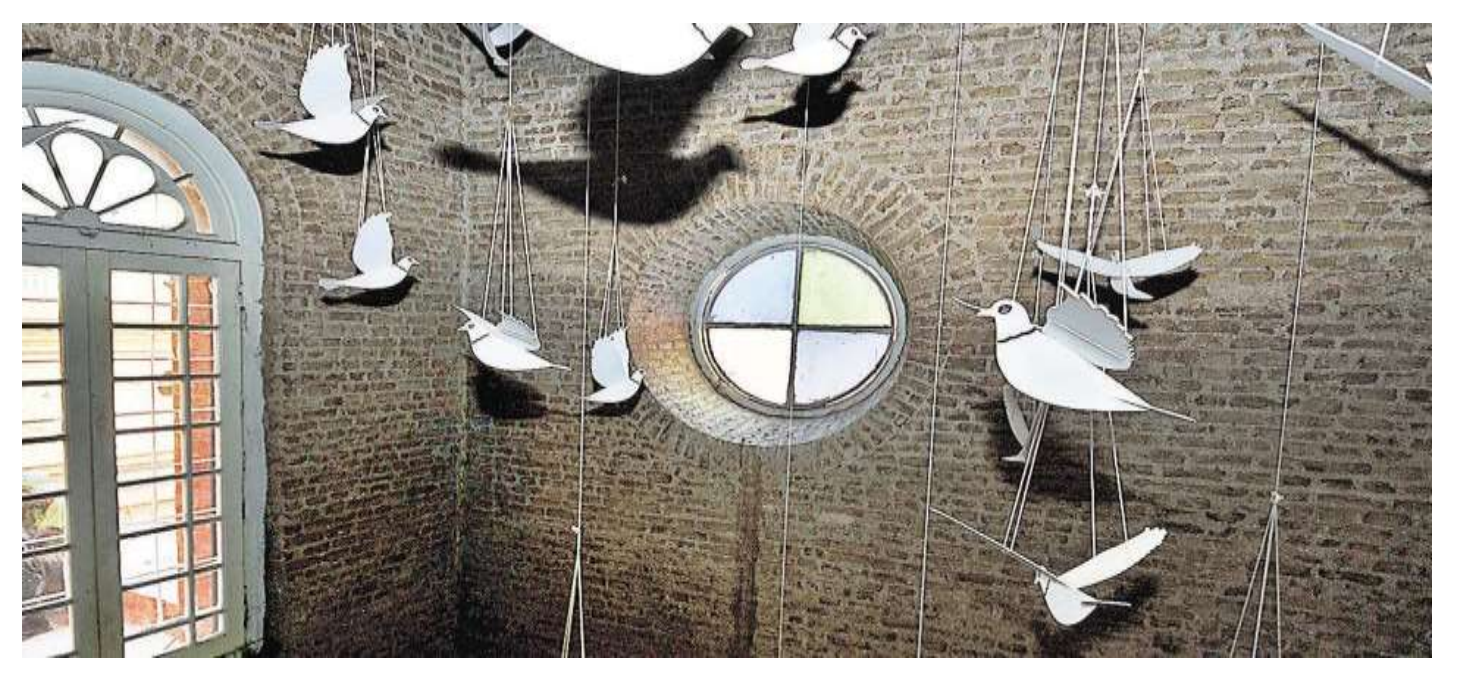
Hanging paper birds in flight showing the pain of migration, at the Partition 1947 Museum in Amritsar.

The pigeons who have made their home in the long-neglected Town Hall building at Katra Ahluwalia near the Golden Temple complex flutter their wings in surprise as their home is coloured, spruced up and gradually coming alive. This is the place chosen to house the Partition 1947 Museum inaugurated by Chief minister Capt Amarinder Singh on Thursday 17.08.2017 morning.