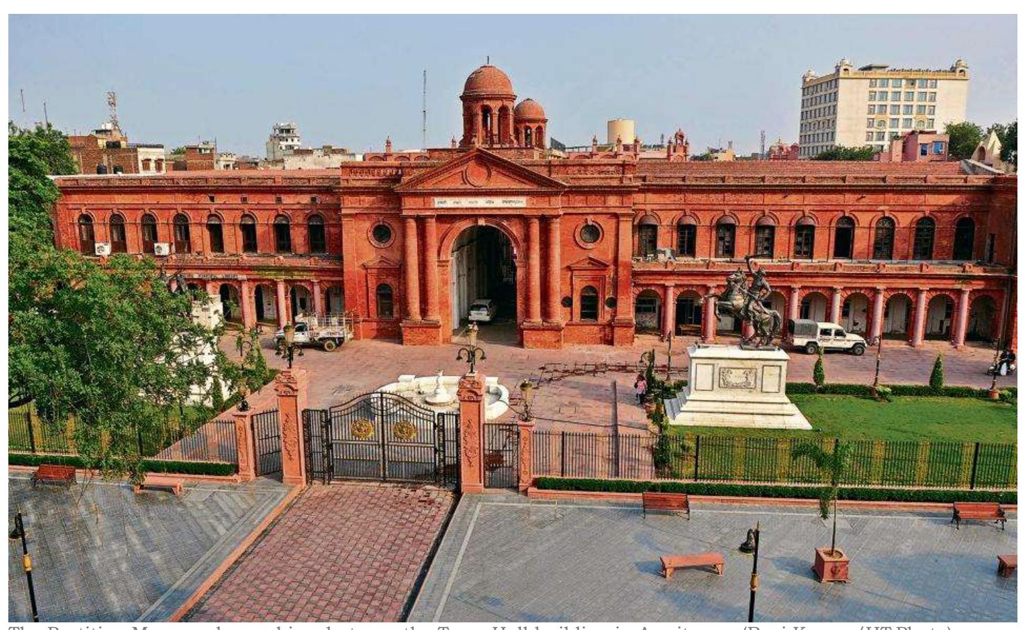
The Partition Museum housed in what was the Town Hall building in Amritsar.